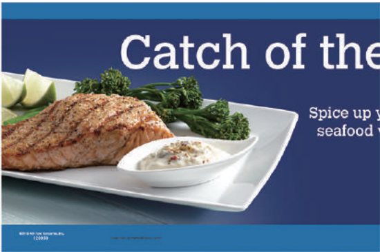
Image Dimension:569 x 373 mm Image Pixel:13440 x 8808 Resolution:600 x 600 dpi