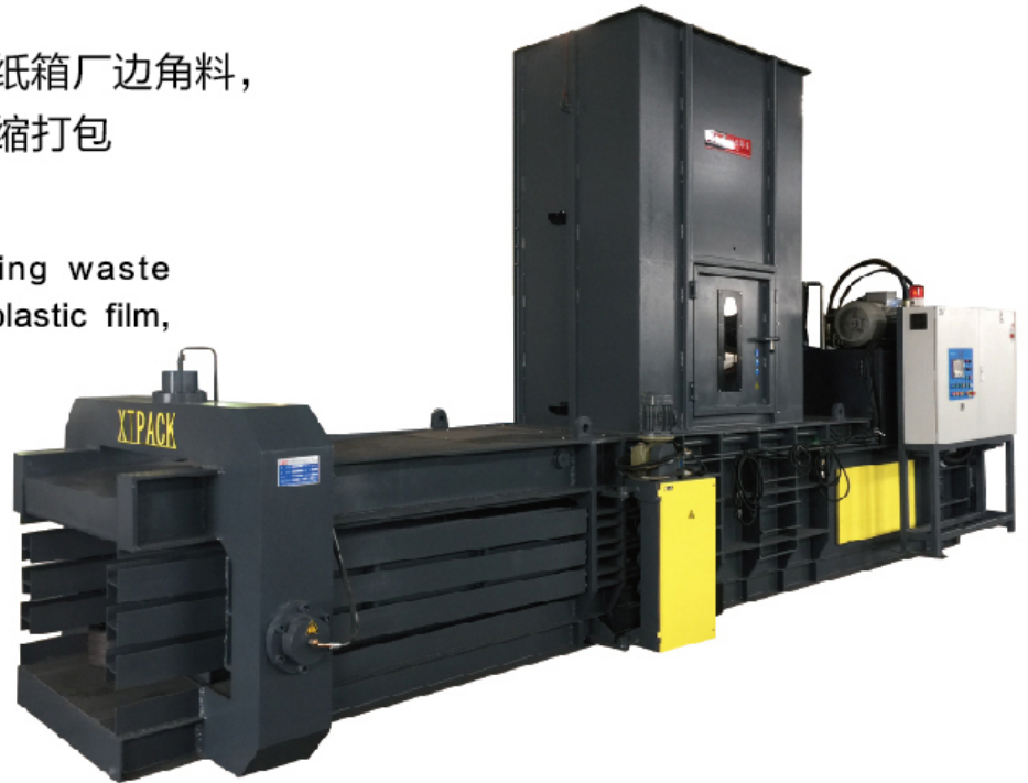
Horizontal Tying Bale size XTY-600W11075-30

Widely used for compressing waste cardboards, cartons, paper, plastic film, straw etc.